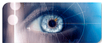
Multisensory Health™ & Sound for Health™